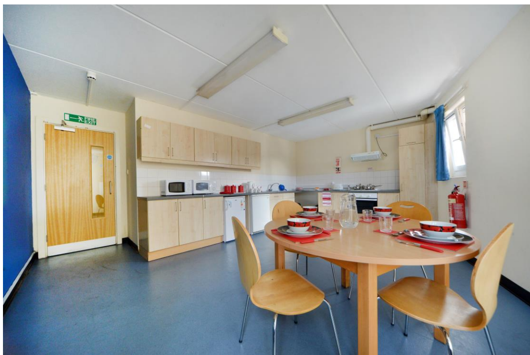
Standard Cluster & Standard Cluster PLUS kitchen/diner