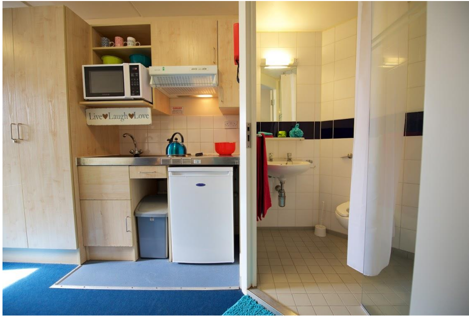
Studio Flat kitchenette and bathroom