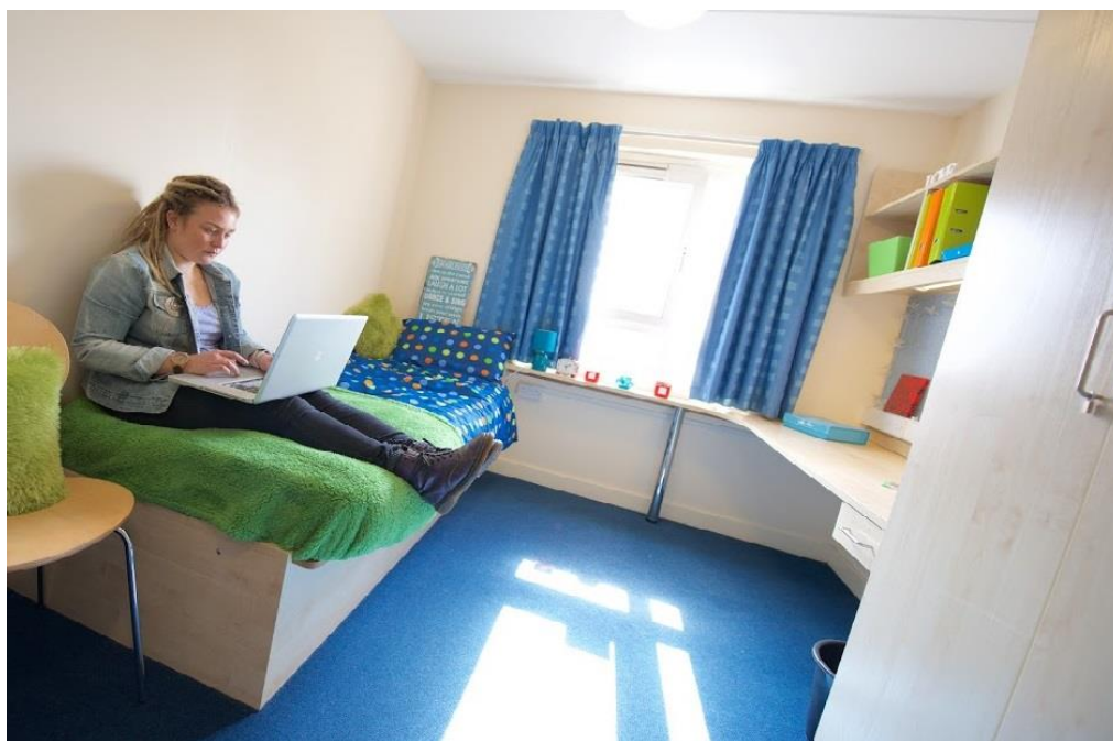
Standard Cluster Flat

These follow the same set up as the Standard Cluster Flats but with a slightly bigger room (still with a single bed).