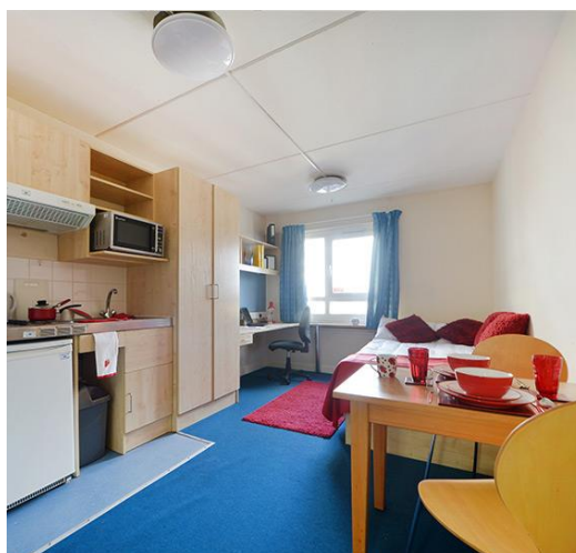
Studio PLUS Flat

Same layout as a Studio Flat but with more space and a larger bed.