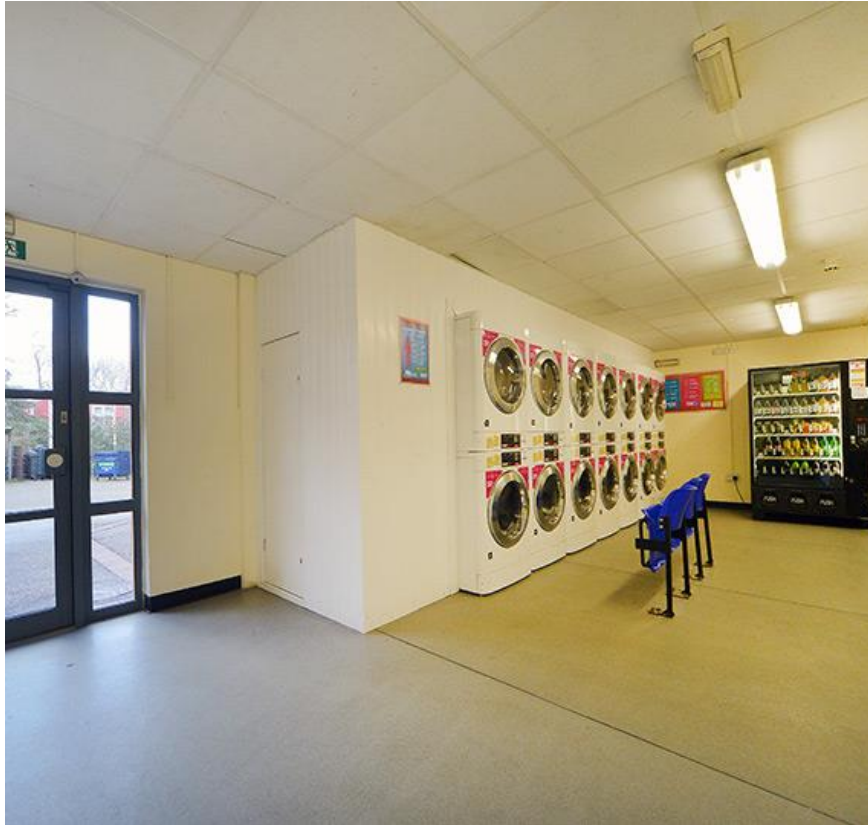
Self-service laundry room or known in the UK as a Laundrette

You will also be responsible for arranging your own TV licence, if you have a TV in your bedroom. If you are in a cluster flat you should note that each bedroom requires its own TV licence. Any TV in the communal areas, i.e. your kitchen/diner, will be covered by a TV licence registered to a bedroom within the flat. 1