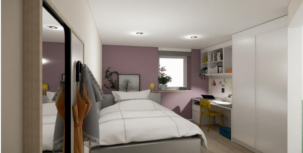
Newly refurbished Cluster room

These are 6 single en-suite bedrooms grouped together with a shared kitchen/diner. We have a particularly large demand for these rooms.