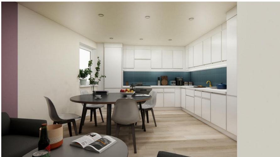
Cluster flat kitchen/diner