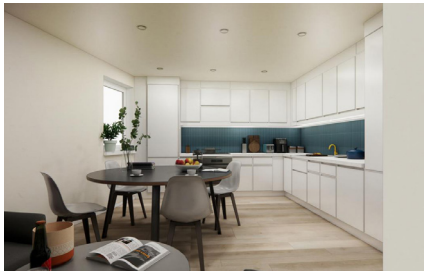
Cluster flat kitchen/diner